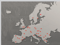
Local partners network